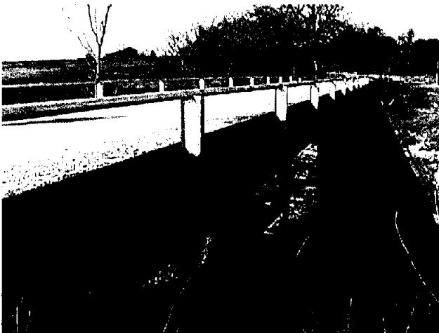
02-249-AA03-66-001 Side Shot Looking North