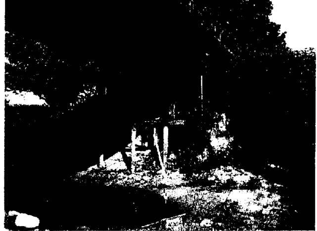
02-249-AA03-66-001 CR. 3585 PCT.J over Salt Creek 6' Exposed Pillings Looking North