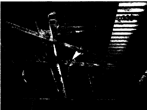
02-249-AA0366-001 Co Rd 3585 @ Salt Creek Under shot of metal plate being used as a patch