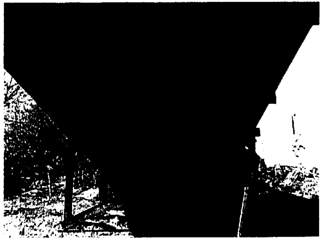
02-249-AA03-66-001 Under Shot Looking North